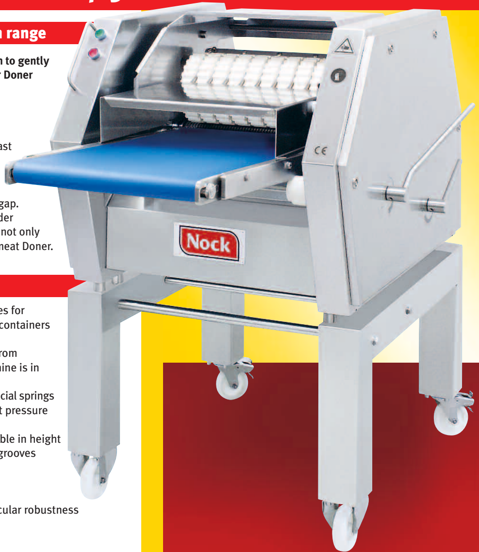
Cortex CB 503 KEBAB with NOCK Integrated Product Return System® (optional)