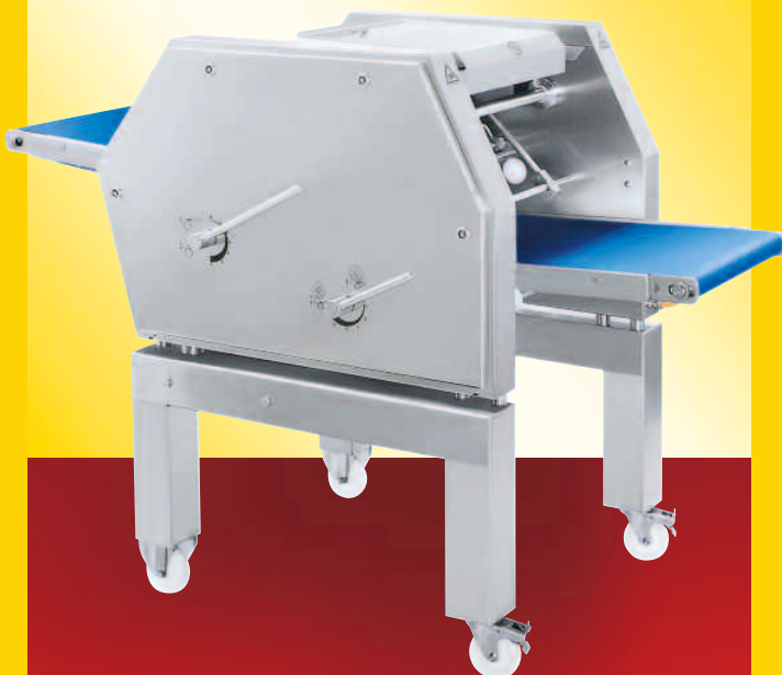
Cortex CB 503 KEBAB with output conveyor for the sliced meat (optional)