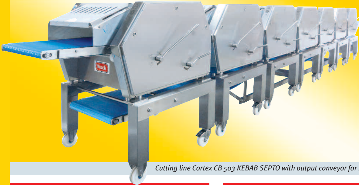
Cutting line Cortex CB 503 KEBAB SEPTO with output conveyor for sliced meat