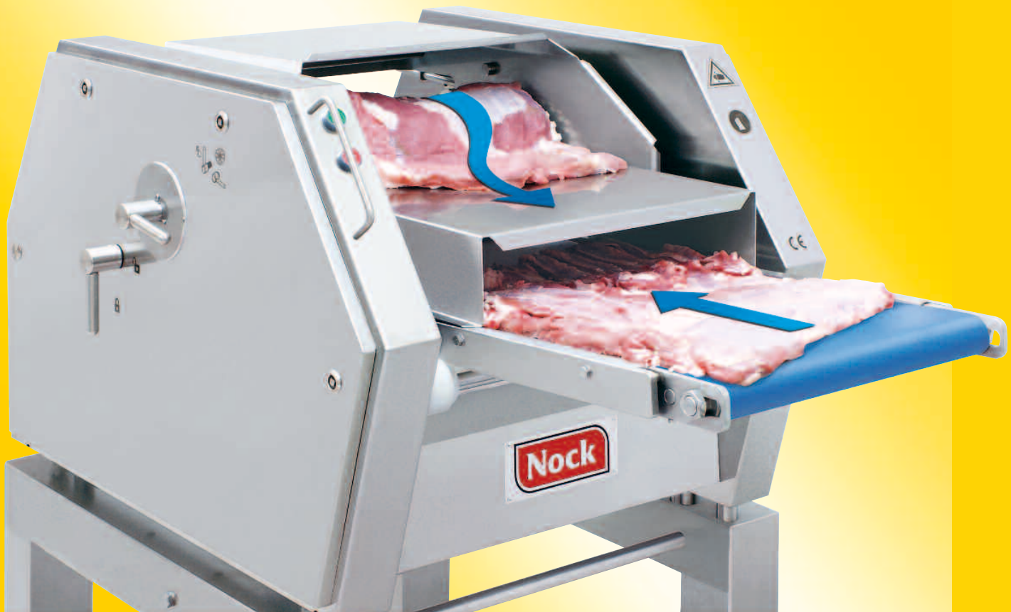
Breast of veal on a Doner cutting machine Cortex CB 503 KEBAB with NOCK Integrated Product Return System®