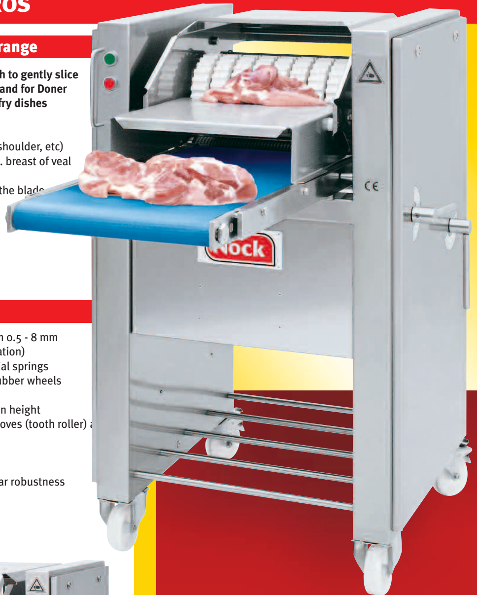
Cortex CB 496 GYROS with NOCK Integrated Product Return System® (optional)