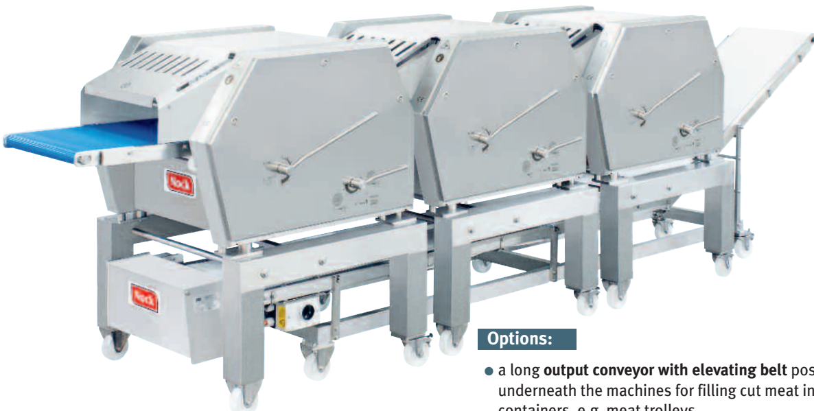
Cutting line Cortex CB 503 KEBAB TRIO with output conveyor for sliced meat