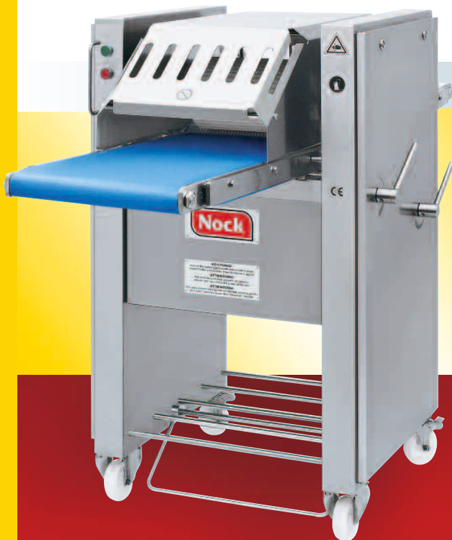
Cortex CB 496 GYROS with NOCK EASY-FLOW® safety cover and optional output conveyor for remaining uncut piece